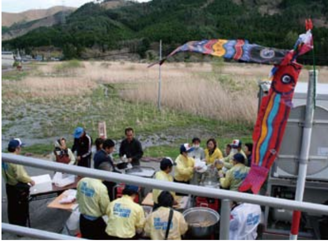
Relief feeding at a beach in Harinohama. A traditional carp flag (koinobori) from Hong Kong flies in the wind. These flags are a tradition in Japan to celebrate children and give hope for the future.