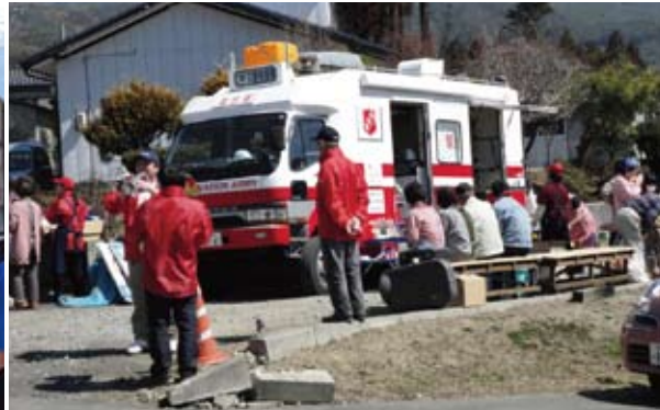
Coffee service and foot baths were provided to those seeking refuge in Rikuzentakata City