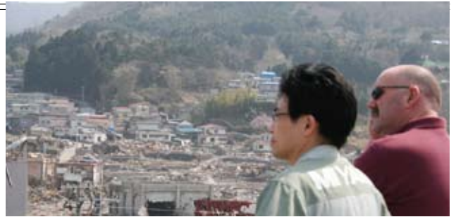
Major Ruthven (from IHQ) is briefed by prefectural staff overlooking the damaged area of Onagawa town.