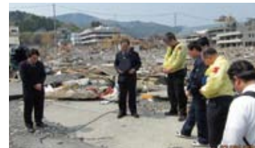
A prayer for Onagawa town.