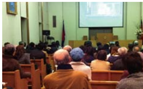
On March 11th, we opened the hall of our headquarters building. Many people gathered since they were stuck after the transportation system was paralyzed. Most could not return home and chose to rest at our hall overnight. Information was displayed on our big screen to keep them informed. Food and drinks were also prepared for the people.