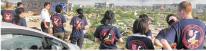
Members of the Youth Caravan view the damage from the tsunami with their own eyes.