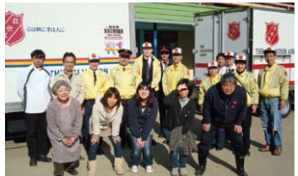
With the staff of the Aiko Kindergarten in Kesenuma City