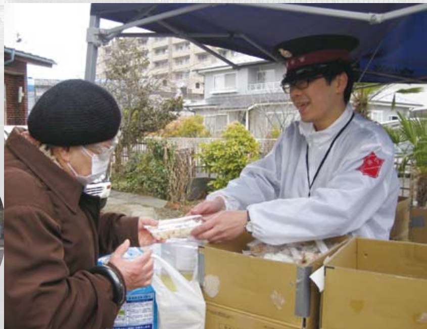
giving lunchboxes and words of encouragement