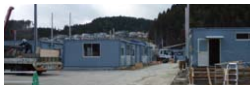
Ongoing construction of temporary housing in Minamisanriku town.

At the newly opened 'Ofunato dream marketplace,' you can see the wood decks, illuminated store signs, and flower pots that were given. They are all being put to good use as people come to shop for their needs.