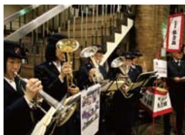
A popular musician (Mr. Haruomi Hosono) is pictured with the cadets and staff of the training college. After his concert, collections for the relief work were taken using our Christmas (Shakainabe) kettle in the lobby.