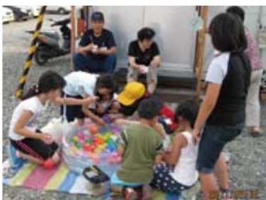
Children gather to play a fishing game for treats and toys.