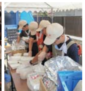
Children are fishing for their favorite sweets in a game (above left). Team members prepare emergency rice meals (above right).