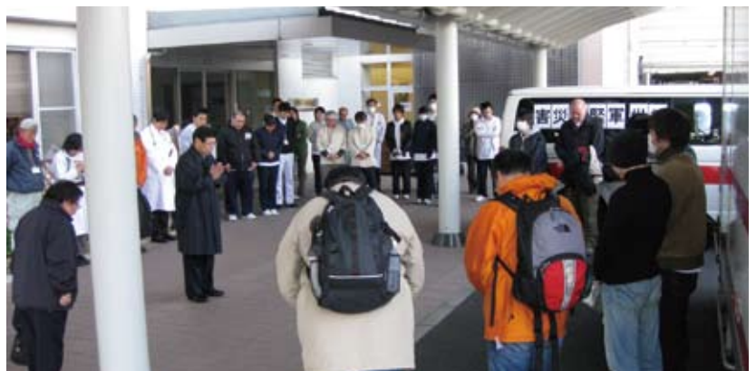
Everyone gathers for prayer before departing to relief work