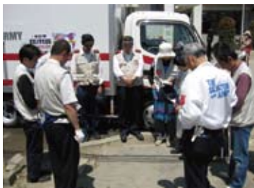
More meals were served at the Kaisenkaku Inn, followed by prayer with the workers