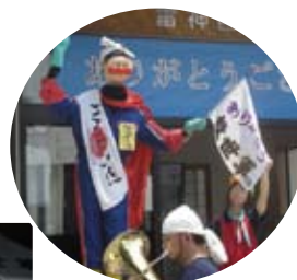
A large automated doll waves a Salvation Army flag to welcome people outside a town hall.