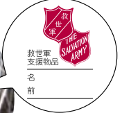
Bicycles were given to people seeking refuge in temporary housing in Miyagi Prefecture. A local bicycle shop assembled the bikes and tuned them for each person.