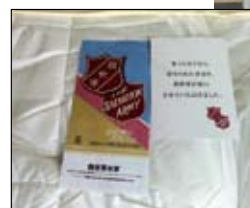
On June 4th, a total of 1750 new futon (bedding) sets were delivered to a temporary housing unit. A Salvation Army brochure was inserted into each one.