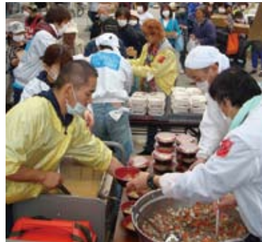
At Watanoha, a nutritious menu using popular dishes is served.