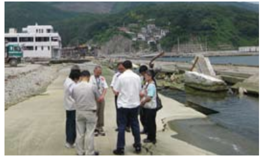
Near a devastated beach in Onagawa town, the team prays for the revival of the area.