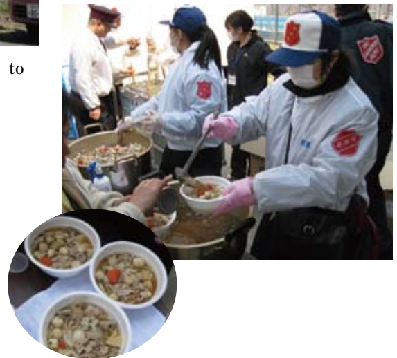
A meal being served at the Onahama high school in Iwaki city. The people were overjoyed to eat a meal full of vegetables, and udon.