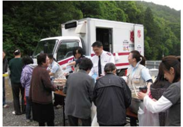
Joy and laughter during a time of serving meals in Urashukusan district of Onagawa town.