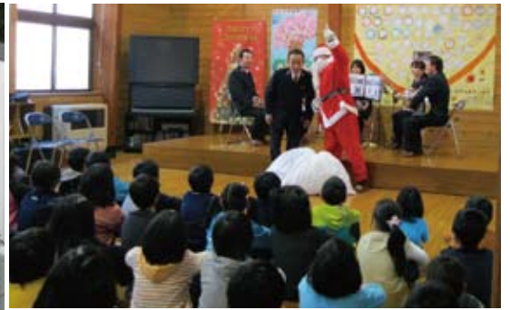
At the Yahagi primary school, a band plays a Christmas song while presents are distributed to children by Santa.