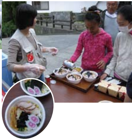
It had been such a long time since the people ate warm ramen. The children were very joyful.