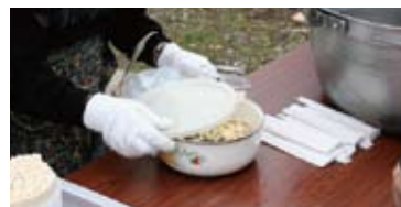
At Kamisan district, pots of ramen are brought to be served for lunch.