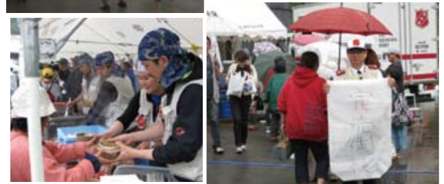
Rice was served from the local area of Miyagi prefecture (above left). In Ishinomaki city (above right), the Ogatsu town market for recovery offers gyudon (rice covered with beef/vegetables) to the people.