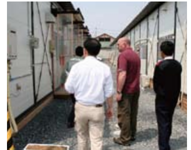
An inspection at a temporary housing unit to research what items are needed.