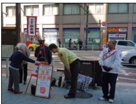
Yahata Corps' Shakainabe (kettle) in Kita Kyushu city