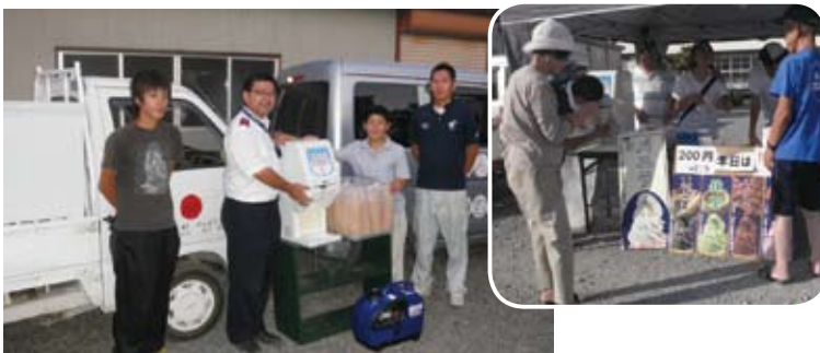
A soft-ice cream machine was given to the Suzuran and Katatsumuri homes for the disabled (located in Rikuzentakata City). Together, we helped to make and sell ice cream and the profits went to the homes.