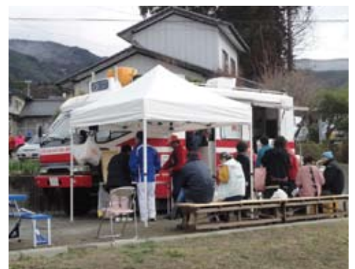
At Rikuzentakata, a donated tent proves to be useful outside.