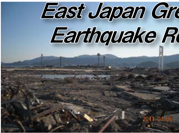
A picture of the destruction caused by the massive tsunami- causing everything to be swept away (Rikuzentakata city)