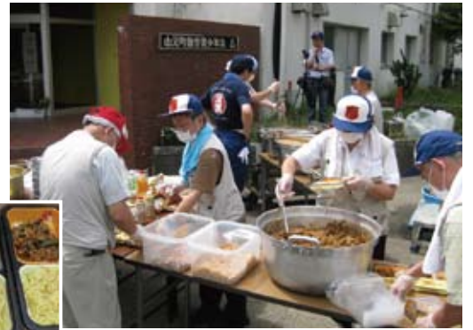
A delicious bento box and misoshiru soup (full of vegetables) is served. The people were very grateful for the nourishing food.