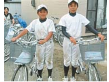
Men, women and students were given bikes to use for daily life. Different types of bikes were presented to each group. The people were very joyful to receive the bicycles.