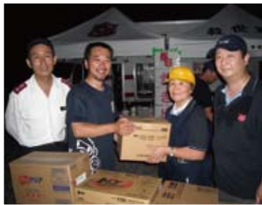
Items for daily use reach Rikuzentakata.