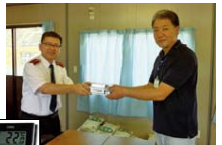
At the request of Miyagi Prefecture, large thermometers were presented in Minamisanriku town to prevent heatstroke.