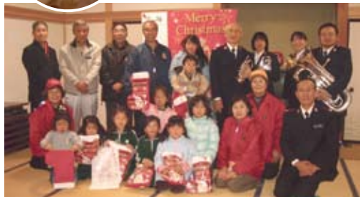
Above: Nukatsukazawa public hall