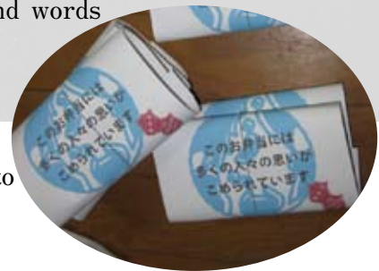
lunchboxes wrapped to stay warm