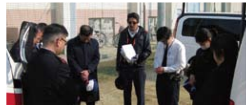
Prayer with relief work team members