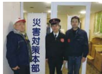
On March 15th, the Men's social welfare center and thrift store went to Mito city to give relief supplies to people seeking refuge there.