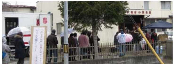
A long line of people outside the Sendai Corps, waiting to receive a meal.