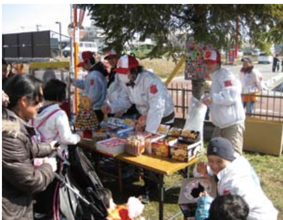
providing candy and snacks for children