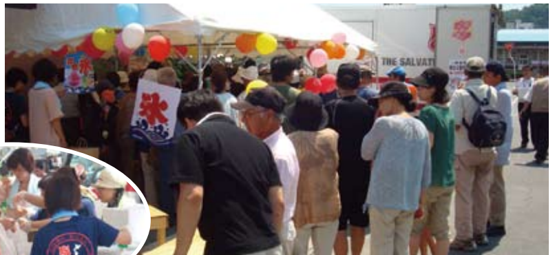
At the Ishinomaki Church of Christ, we served cotton candy and shaved ice at the children's meeting- followed by gyudon and cold drinks for lunch. There was a large gathering of local people at the event.