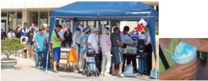
Outside of a large gym complex in Onagawa, a long line forms for shaved ice. It was a welcome treat in the intense heat of the summer.