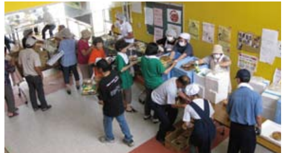
Handmade delicious meals are presented at Yamamoto town in Watari county.