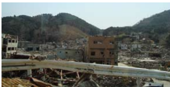
Center: a scene of serious damage in the town of Onagawa. This area was completely destroyed