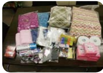
Above left: Bottled water sent from Korea for use in relief work.